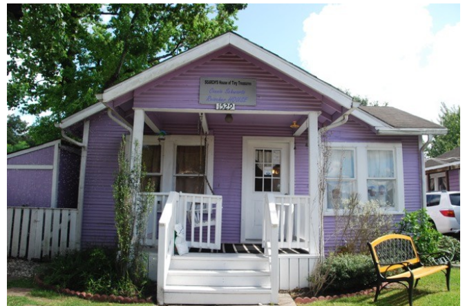
House of Tiny Treasures